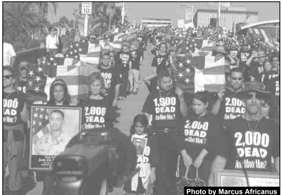
Give Peace a Chance: San Fernando and Los Angeles Greens, turned out in great numbers to support the Veteran's Day Procession of Coffins at Arlington West In Santa Monica. Over 2,000 crosses were put on the beach to honor the dead in Iraq.