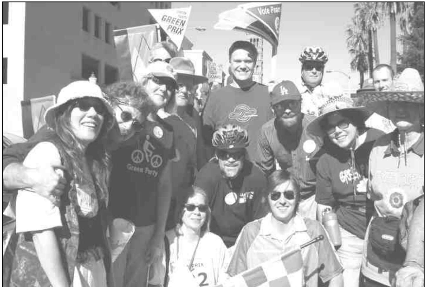
The Green Prix: Gentleman Stop Your Engines: More than 20 members of the LA Greens turned out in the hot sun at the 2005 Doo Dah parade in Pasadena to bring a strong sustainable energy, conservation and anti-war message to the parade. More than 40,000 people turned out to watch the annual spectacle, which is a parody of the city's Tournament of Roses Parade.