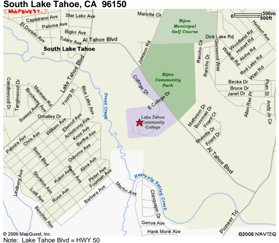
Day 1 Lake Tahoe Community College One College Drive

September 9-10, South Lake Tahoe, CA. Hosted by Green Party of El Dorado County.